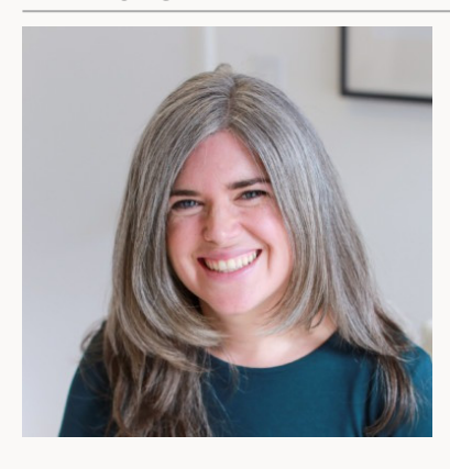
Back To Top